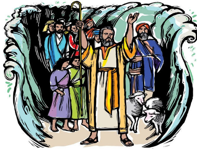
Moses Parts the Red Sea